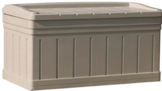
Examples of acceptable Suncast storage boxes

5. Storage – One container, not to exceed 135-gallon capacity, may be used for storage under decks, on decks, or on patios. The container must be of commercial manufacture and not a homemade configuration. This requirement for commercial manufacture is to maintain the consistent appearance across all of Summerfield Units. The Board recommends the use of the Suncast containers depicted below. They can be purchased at The Home Depot, Wal-Mart, Target, Lowe’s, Amazon, Sam’s, and Costco.