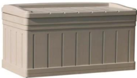
Examples of acceptable Suncoast storage boxes

5. Storage – One container, not to exceed 135-gallon capacity, may be used for storage under decks, on decks, or on patios. The container must be of commercial manufacture and not a homemade configuration. This requirement for commercial manufacture is to maintain the consistent appearance across all of Summerfield Units. The Board recommends the use of the Suncoast containers depicted below. They can be purchased at The Home Depot, Wal-Mart, Target, Lowe's, Amazon, Sam's, and Costco.